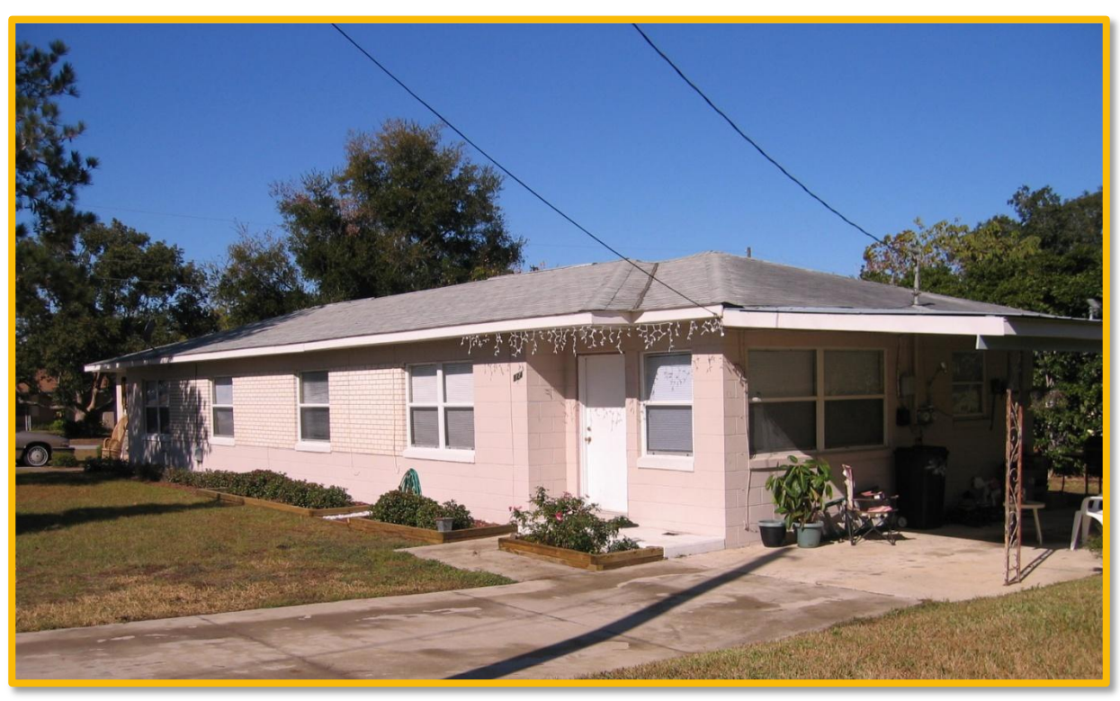
View looking Northwesterly