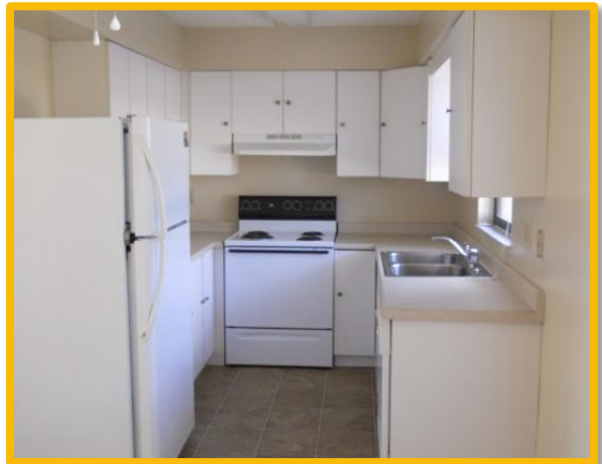
Kitchen View Typical Unit