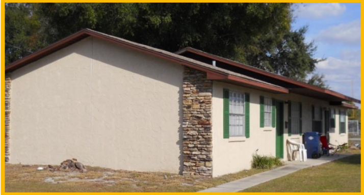
Exterior View Typical Duplex Unit