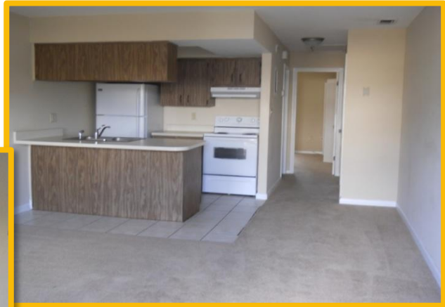
Kitchen View Typical Unit