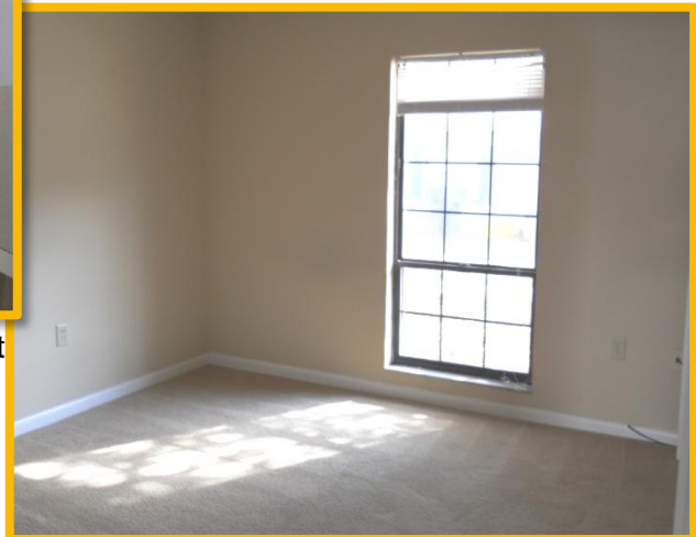
Bedroom View Typical Unit