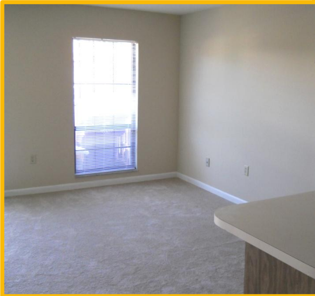
Living Room View Typical Unit