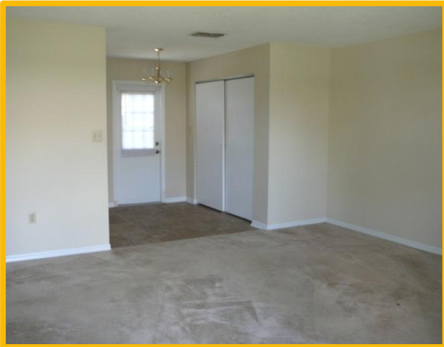
Living Room View Typical Unit