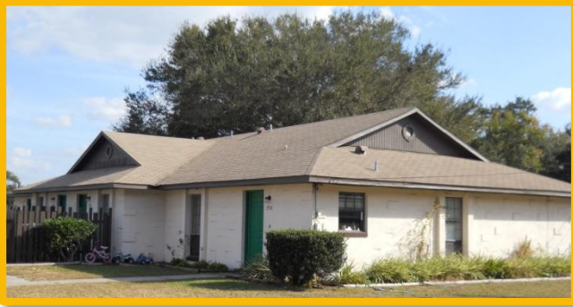
Exterior View Typical Unit 4-Plex